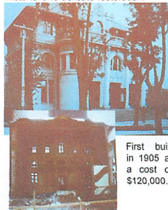
First built in 1905 at a cost of $120,000.