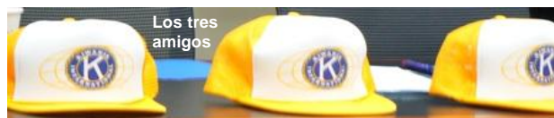
Los tres amigos