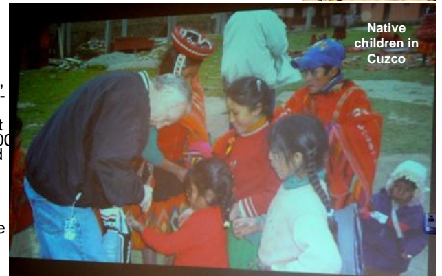
Native children in Cuzco