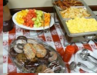
As CHK members begin to eat, they respond a sports quiz to win a prize.