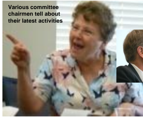
Various committee chairmen tell about their latest activities