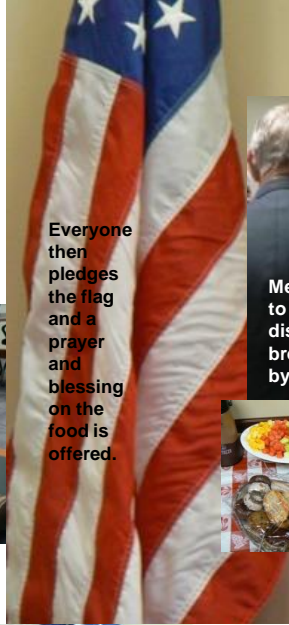
Everyone then pledges the flag and a prayer and blessing on the food is offered.