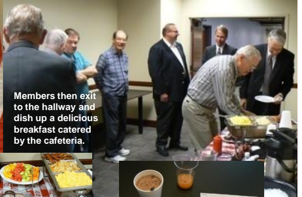
Members then exit to the hallway and dish up a delicious breakfast catered by the cafeteria.