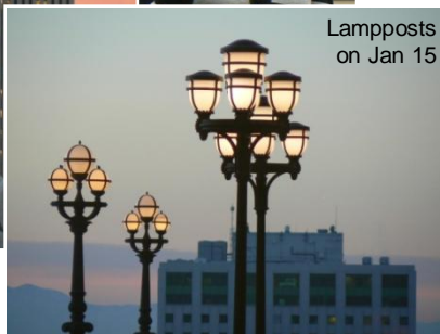
Lampposts on Jan 15

Walkathon to Ensign Pk. for needy Africans, May 2.