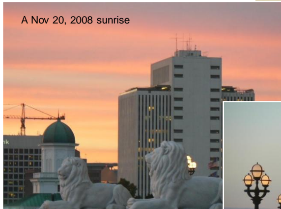
A Nov 20, 2008 sunrise